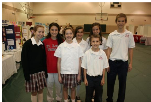
Sixth grade Science Fair ribbon winners.